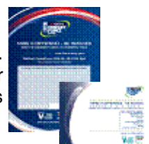
Poster and postcard

for your Cricket Development Manager please email the helpdesk - natwestcricketforce@ecb.co.uk .