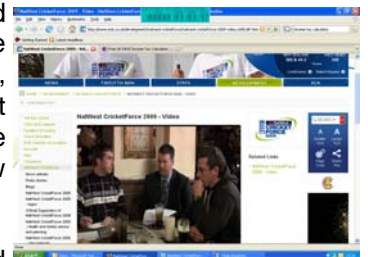
The DVD is ready for viewing

We have recently made some great additions to the online resources we offer registered clubs to help with their NatWest CricketForce event planning. First and foremost we are pleased to announce that the NatWest CricketForce 2008 DVD is available to view on ECBtv, just click here or go to www.ecb.co.uk/natwestcricketforce and look for the link on the left hand side. This DVD shows clubs a step by step guide on how to organise your CricketForce event using the example of Kirby Muxloe Cricket Club, Leicestershire, who constructed a new pavilion as well as making other improvements around their ground.